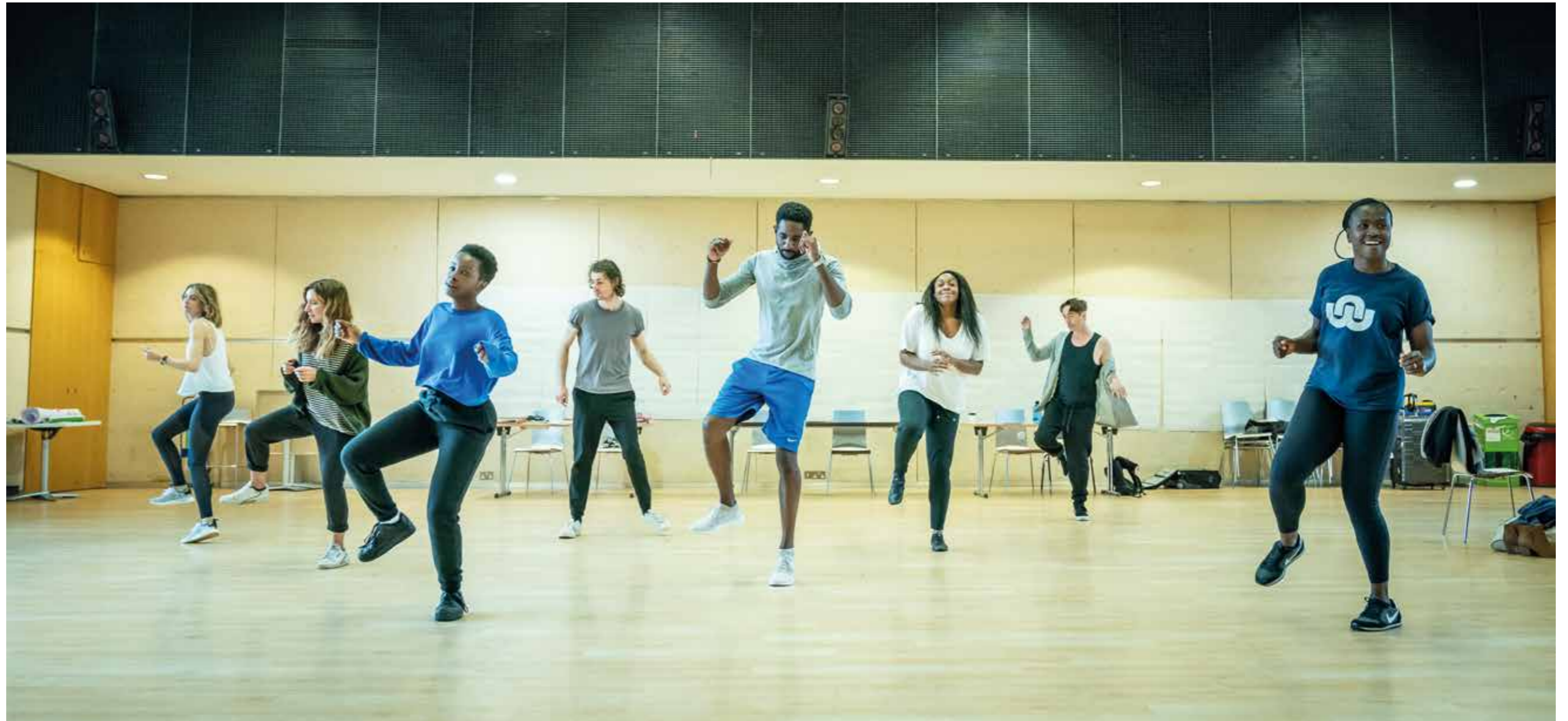
The company of Young Vic's Fairview in rehearsal in Jerwood Space, 2019.