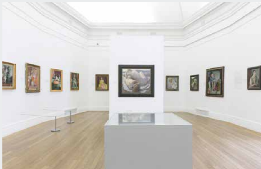
Leon Kossoff (b.1926) Woman Resting (The artist's mother) , circa 1963 25 Works for 25 Years: Celebrating the Jerwood Collection Sotheby's, London June 2018