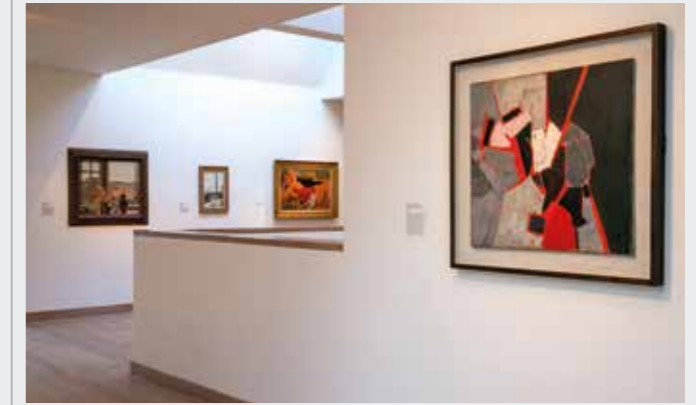
Adrian Heath (1920-1992) Composition Red, Black and Grey, 1957 Jerwood Collection: 25 Years Jerwood Gallery, Hastings Jan-April 2018