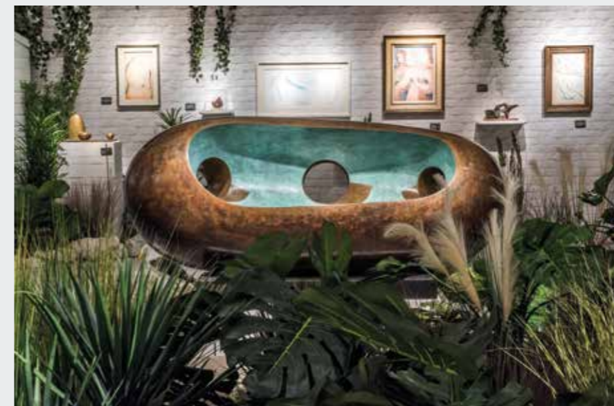
Dame Barbara Hepworth (1903-1975) Study for Lisa (Hands to Face), 1949 Barbara Hepworth: Formed from Nature, Dickinson Private Advisors and Fine Art Dealers, Frieze Masters, October 2018.