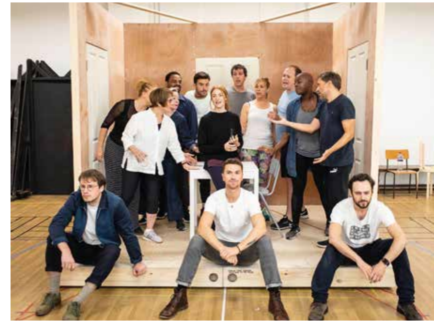
The cast of Company in rehearsals, directed by Marianne Elliott.

Not all of the shows we hosted were destined for London. We took several