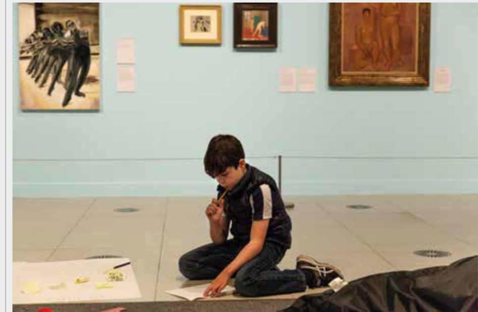
Darkness Into Light: The Emotional Power of Art , Millennium Gallery, Sheffield October 2018 - January 2019