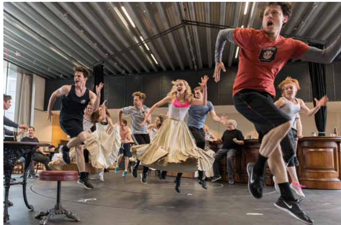
Opposite top: The company in rehearsals for Sonia Friedman's Dreamgirls directed by Casey Nicholaw