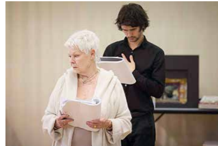
This page bottom: Gillian Anderson in rehearsals for The Young Vic's A Streetcar Named Desire directed by Benedict Andrews

2,278 different performing arts companies have rehearsed here over the last 20 years