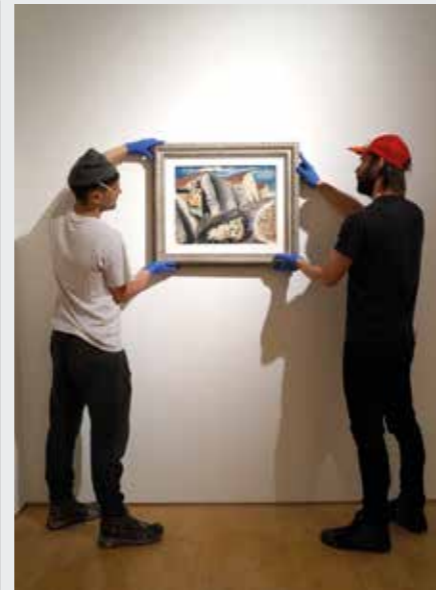
John Piper (1903-1992) Beach and Star Fish, Seven Sisters' Cliff, Eastbourne 1933-34 John Piper, Mead Gallery, Warwick May-June 2018