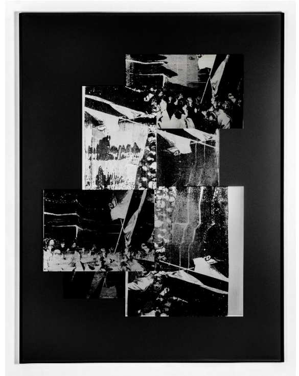
Image credits in notes to editors | Further images can be found here .

Jerwood Arts, 15 January – 8 March 2020 Press View 14 January, 9:00am-10:30am