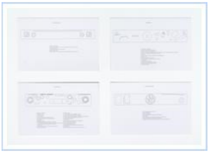
2<sup>nd</sup> Prize Winner (£3,000):