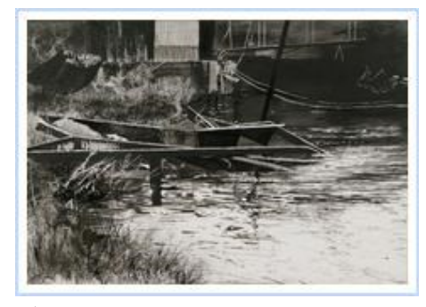
1<sup>st</sup> Prize Winner (£5,000)

The Jerwood Charity and Wimbledon School of Art are delighted to announce the winners of The Jerwood Drawing Prize 2005: