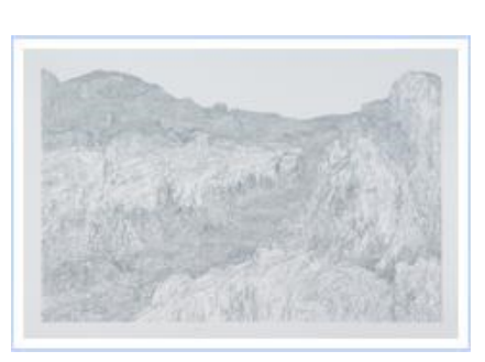
3<sup>rd</sup> Prize Winner (£2,000):