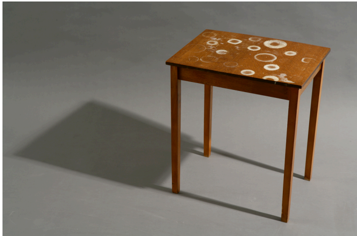
Untitled (tea table), Side table, hot drink rings, 50 x 50 x 50 cm, by Cadi Froehlich

'Untitled (tea table) has evolved from a process of work looking at what was, what isn't and what could be. Mindful of the passing of time and the potential of the future, this period of work has questioned the reality of the now. Evoking moments spent, lost or yearned for, the table bears the marks that illustrate meetings, conversations and quiet contemplations spent over a cup of tea. The format of the drinking and the style of cup changes, as does the purpose, aim or hope in the moment of the drinking.'