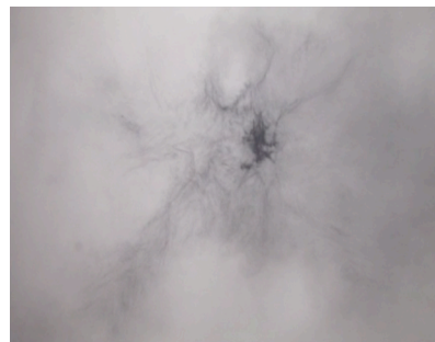
Burst, Film (of graphite Balloon bursts), 5 mins: 15 secs, by James Eden & Olly Rooks