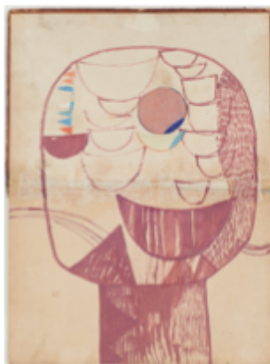
Annette Fernando, Wait a minute, it's the truth and the truth hurts XIV , 2013. Ink on paper, 23 x 32cm. © Annette Fernando Sally Taylor, Confused Head 27 , 2014. Posca pen and paper collage on found book cover, 40 x 34cm © Sally Taylor

In this special anniversary year the exhibition reflects a variety of different approaches to drawing from practitioners working across the creative disciplines, from works on paper; charcoal, watercolour, graphite, gouache, oil, mixed media, coloured pencil, crayon and even thread, to papercut, photo-documentation, plaster and pigment, a sunlight drawing, video work (filmed drawing) and the winning sound installation.