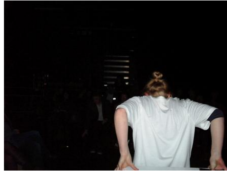
The Hut Project, The Trouble With Women (detail) 2011. Courtesy the artists and Limoncello Gallery, London, UK