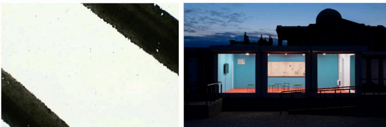
Katie Schwab, Covers (film still) 2016; Together in a Room , Installation view, 2016. Courtesy the artist.