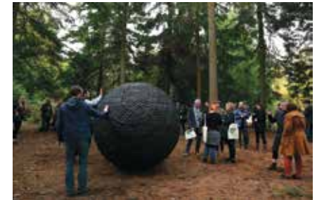
➔ Semiconductor, Cosmos (2014). Jerwood Open Forest, supported by Jerwood Charitable Foundation and Forestry Commission England.